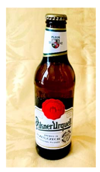
Fig 5: A bottle of Pilsner Urquell beer made in Czech. It contains 330 ml beer, which has good quality and won the reputation as the king of beers.