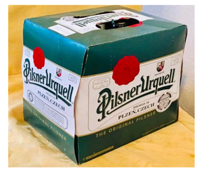
Fig 4: A box of Pilsner Urquell. It contains 12 bottles of 330 ml beer, which can be purchased from Total Wine Shorp.

Fig 3: The color of the 15-herb extract, as it is shown on the inner glass wall after the extract was poured out. Compare with Fig 2.