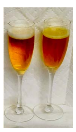
Fig 6: The cup in the left contains 100 ml of Pilsner Urquell beer. The cup in the right contains 100 ml of Pilsner Urquell beer plus 2 ml of 15-herb extract. The latter one is less transparent with slightly yellowish bubbles flouting on the surface.